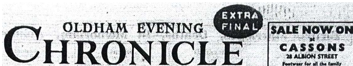
"Footwear for all the family" – an advertisement for Cassons Shoes (1970s)